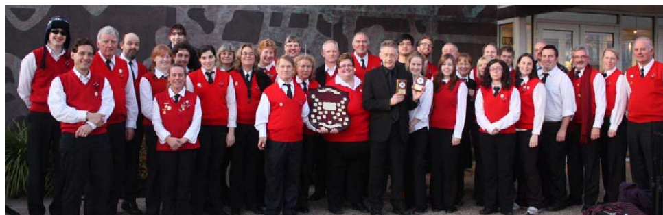
Southern Area Concert Band celebrates 1st place at the Victorian Band Championships. Ballarat, August 20, 2011.